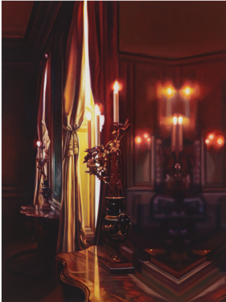
The Met IV , 2018 oil on hardwood panel 24 x 18 inches