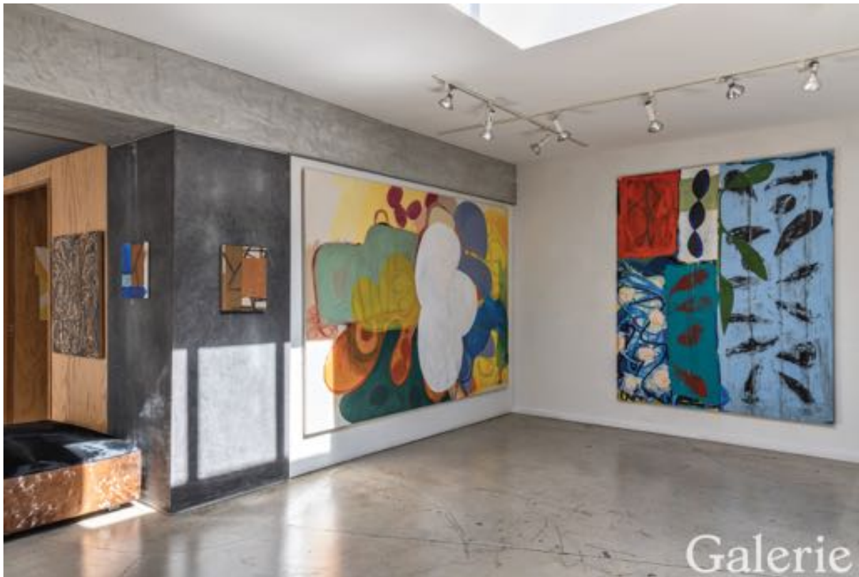
Two of the artist’s large paintings from the 1990s hang in the corner of a gallery space in the studio.

With some help from contractors, that’s essentially what the Arnoldis did, creating a 4,000-square-foot, three-bedroom residence composed of voluminous interconnecting cubes with walls of troweled concrete and floor-to-ceiling glass doors that run half the length of the structure. Inside, the walls are accented by steel-channel baseboards, while the millwork is hewn from marine-grade plywood—the same material Arnoldi used as the base for the celebrated series of “Chainsaw” paintings he produced in the ’70s and ’80s.