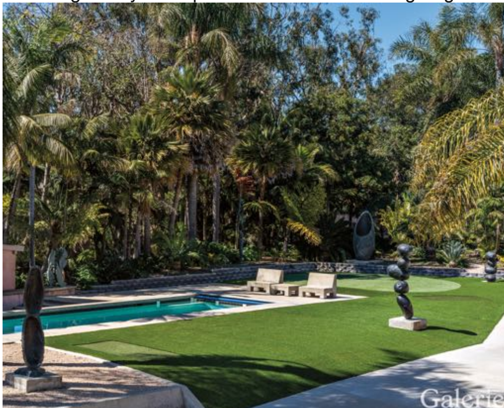
Sculptures and furniture by Arnoldi are arrayed around the pool and putting green.