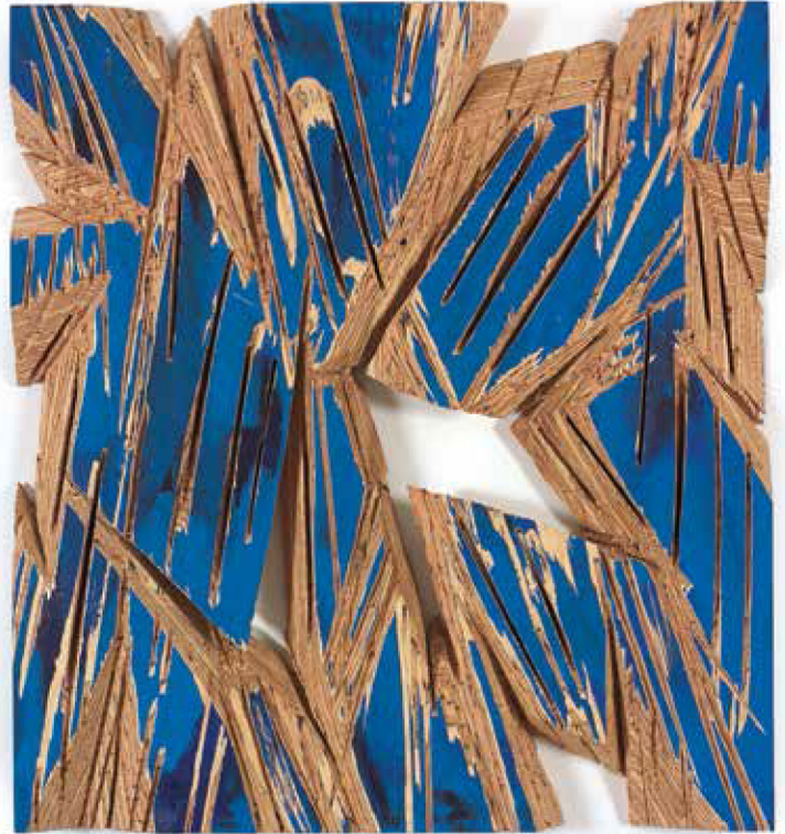
Clockwise from top left: White Knuckles , 1987, acrylic on plywood, 40 x 36 x 3 in.; Welfare , 2011, acrylic on plywood, 52 x 48 x 3 in.; Untitled , 1981, acrylic on wood block, .5 x 10.5 x 12 in.

which he essentially drew with sticks. Found in the woods and stripped of their bark, the sticks were pieced together by Arnoldi on his studio floor. The stick drawings, such as the sparse Untitled (1971) and the denser, diamond-like Untitled (1973), though largely flat, suggested three-dimensionality through their composition, not unlike Cubism. Several drawings in the show, rendered in gouache, watercolor, and pencil, show Arnoldi playing with the possibilities of the sticks as clean, rigid lines.