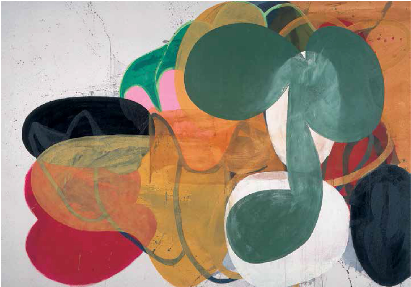
Charles Arnoldi, Group Think , 1996, acrylic on canvas, 84 x 120 in.

CHARLES ARNOLDI'S INTRICATE CAREER IS TRACED IN AN EXHIBITION AT THE BAKERSFIELD MUSEUM OF ART. BY SARAH E. FENSOM