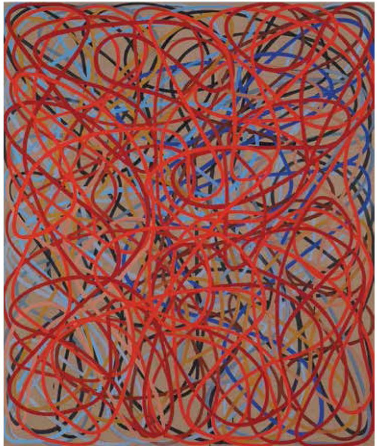
Clockwise from top left: Untitled , 1982, gouache on paper, 7 x 5 in.; Slide Bite , 2016, oil on linen, 84 x 72 in.; Untitled , 2015, oil on aluminum, 8.5 x 6.25 in.

examined at different angles, as if looking at a disorienting collage of photographs from the same shoot. In “Medals,” a simultaneous series, the artist harkens back to the ’60s, with an updated look at Minimalism and experimentation with materials. Various shapes in aluminum or copper are joined together to create sculptural wall-mounted pieces. The results, as with Untitled (2005), are vibrant works that seem at once deconstructed and like combinations of blocks.