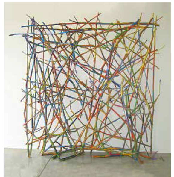
Clockwise from top left: Untitled , 2018, oil on linen, 82 x 72 in.; Untitled , 2015, gouache on paper, 14 x 10.25 in.; Second Chance , 1980, acrylic on sticks, 115 x 134 x 27 in.

In the 1970s, Arnoldi began creating wall-mounted works in