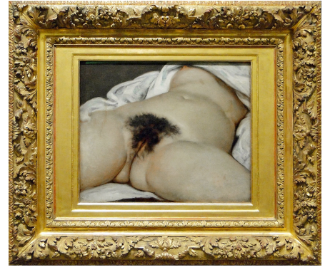
Gustave Courbet, Origin of the World , 1866

The Origin of the New World is a sequel to Elena Dorfman's 2004 seminal series of photographs, Still Lovers , which examined the domestic relationships between people and their sex dolls. This current series of photographic light boxes was inspired by Gustave Courbet's famous painting, Origin of the World ( L'Origine du monde ), his shocking and erotic portrait of female genitalia created in 1866. Dorfman's interpretation, Origin of the New World , replaces Courbet's flesh-and-blood model with a silicone sex doll. Visible only when the light box is switched on, the doll's prone figure is illuminated through a one-way mirror. The darkened mirror—normally used for surveillance and interrogation—is