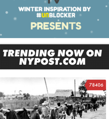
Japanese exhibit reveals live dissections of US POWs

The show, "Freedom Journey 1965," captures not only the marchers but the hardscrabble landscape of that segregated time, right down to the ditches along the