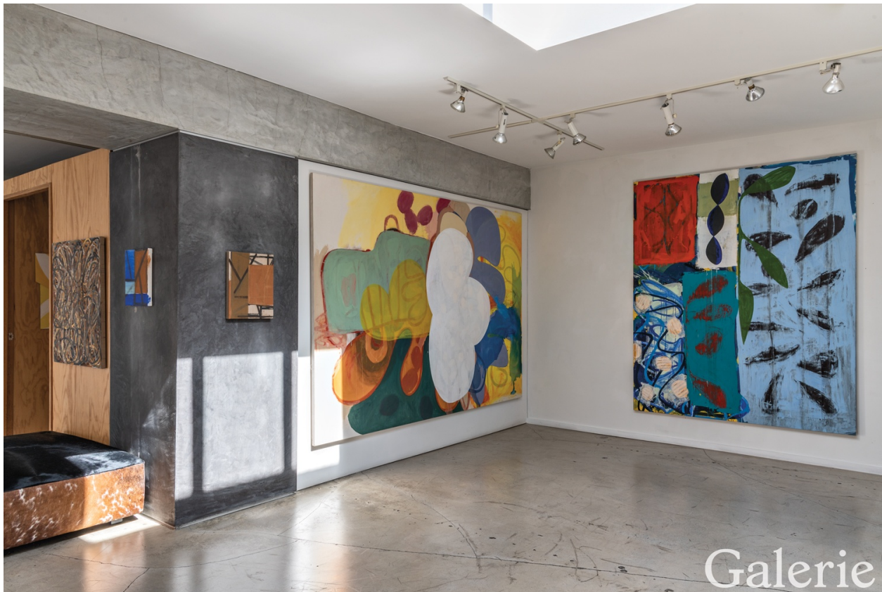
Two of the artist’s large paintings from the 1990s hang in the corner of a gallery space in the studio.

With some help from contractors, that’s essentially what the Arnoldis did, creating a 4,000-square-foot, three-bedroom residence composed of voluminous interconnecting cubes with walls of troweled concrete and floor-to-ceiling glass doors that run half the length of the structure. Inside, the walls are accented by steel-channel baseboards, while the millwork is hewn from marine-grade plywood—the same material Arnoldi used as the base for the celebrated series of “Chainsaw” paintings he produced in the ’70s and ’80s.