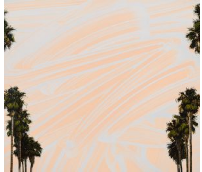
Ode to Moe by Mel Ramos