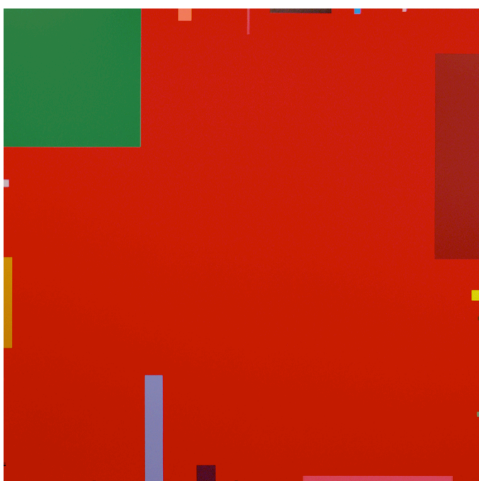
"Red Square" (1974), acrylic on canvas by David Simpson.