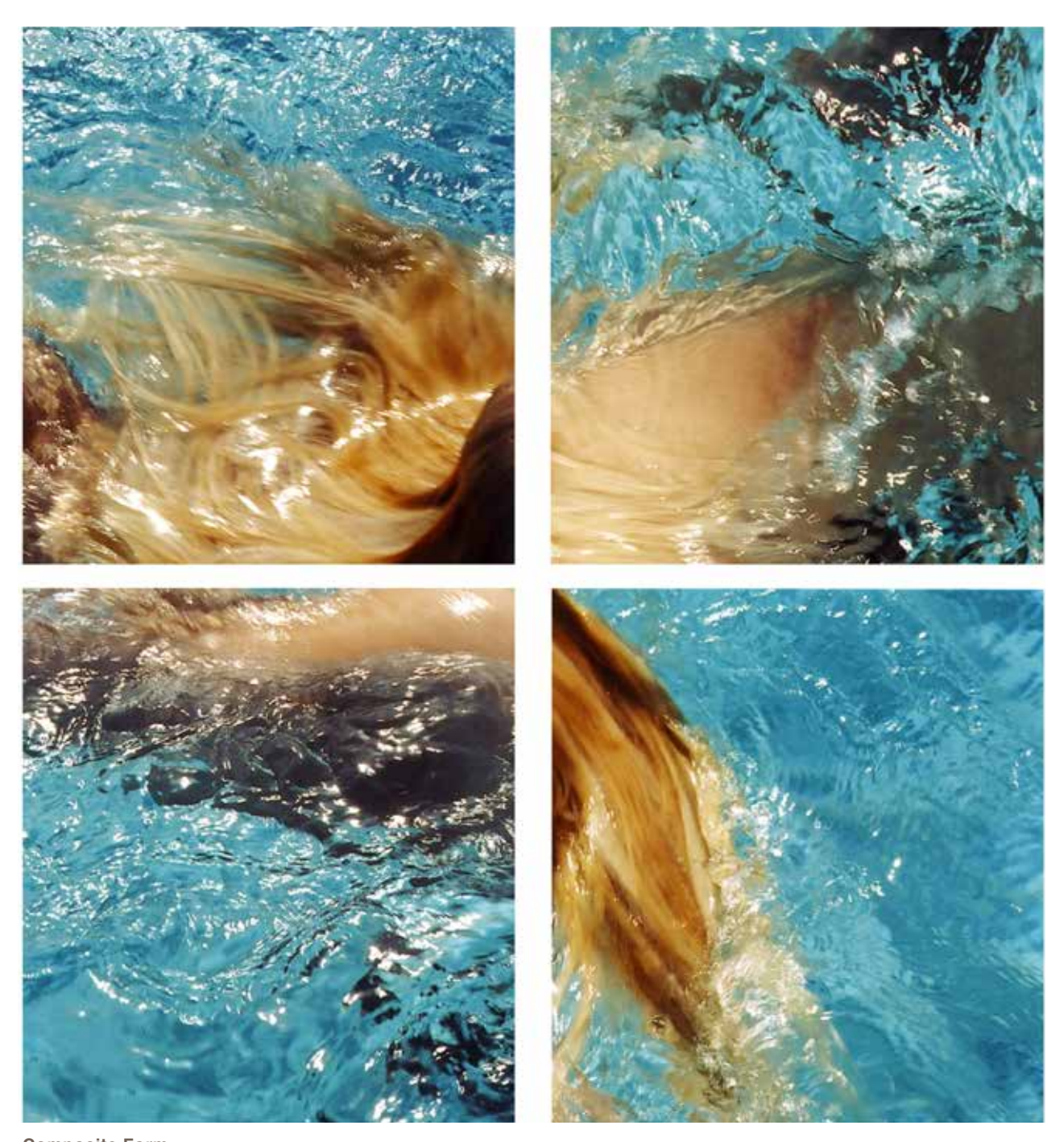
Composite Form Abstract Mermaid 266b 266a 269a 269c, 2015, Archival pigment print, Each individual piece 24 X 22 inches (61 X 55.8 cm), Total installed 50 X 46 inches (127 X 116.8 cm) Edition of 3 + 1AP