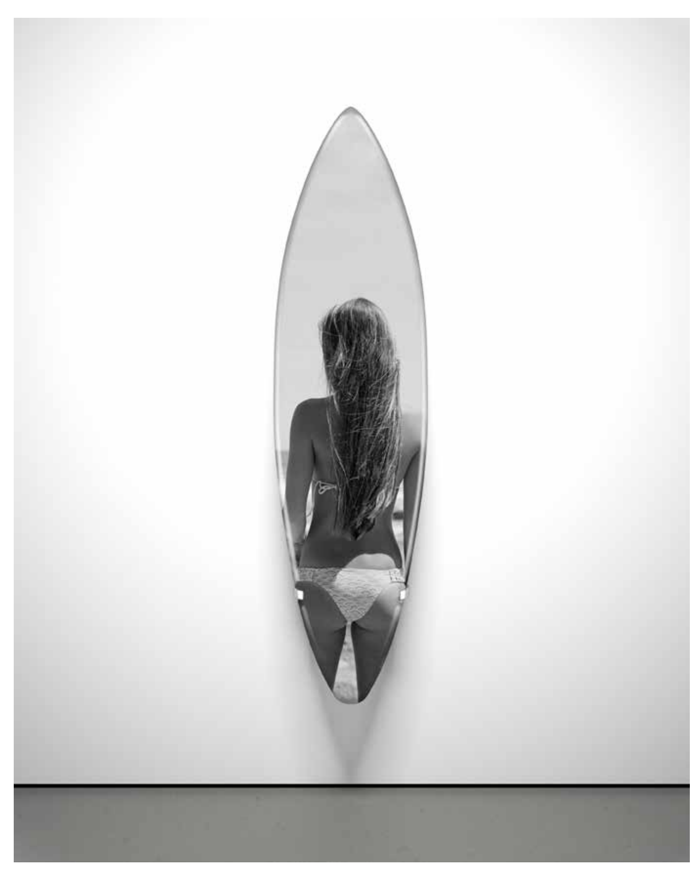
Sculptural Form Brittany, 2015, Fabric, pigment, fiberglass and resin on foam, 78 X 21 X 2.5 inches (198.1 X 53.34 X 6.35 cm) Edition of 1 + 1AP