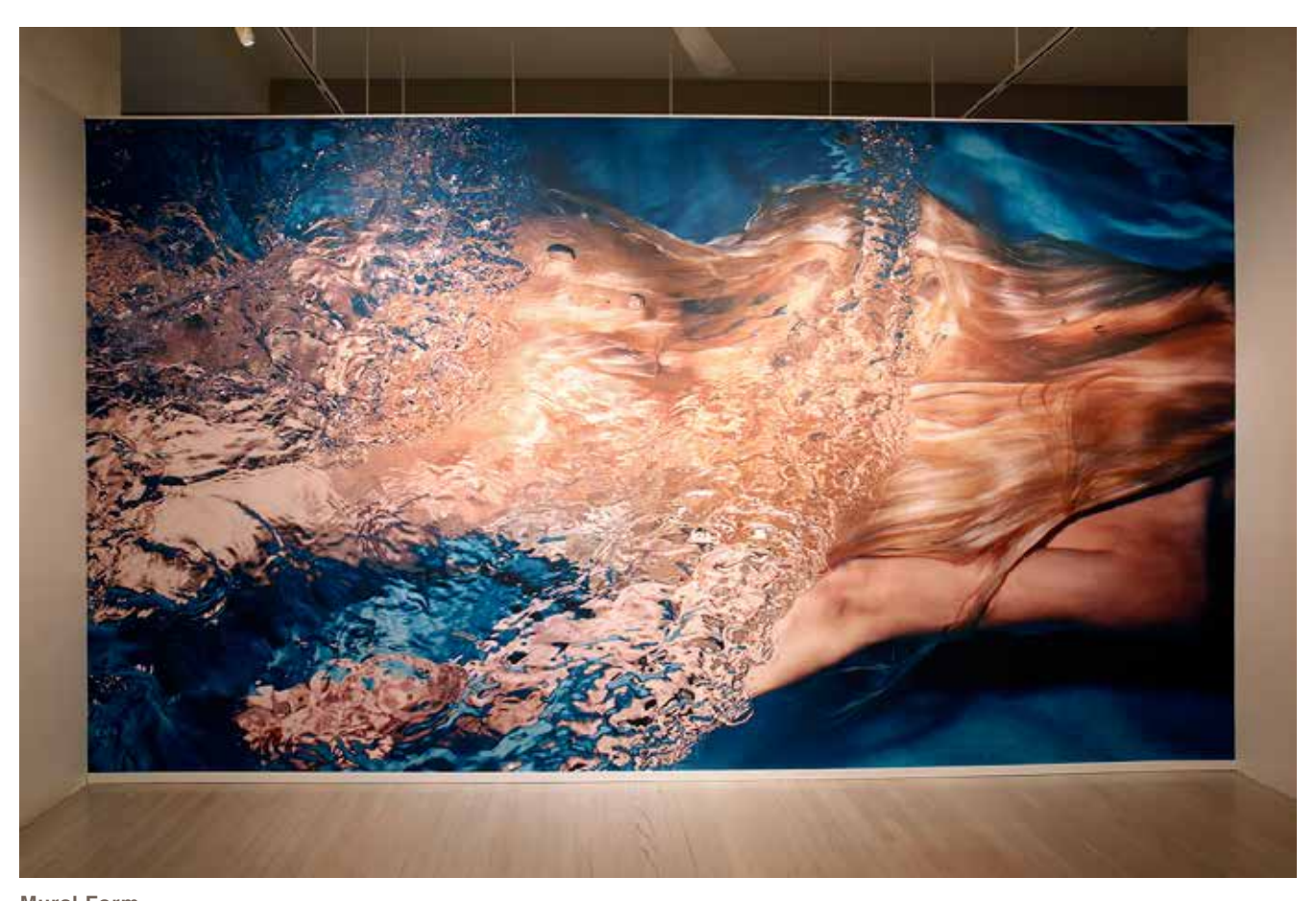
Mural Form Mermaid 36, 2015, archival pigment on coated canvas, 192 X 108 inches (487.68 X 274.32 cm) Edition of 1 + 1AP