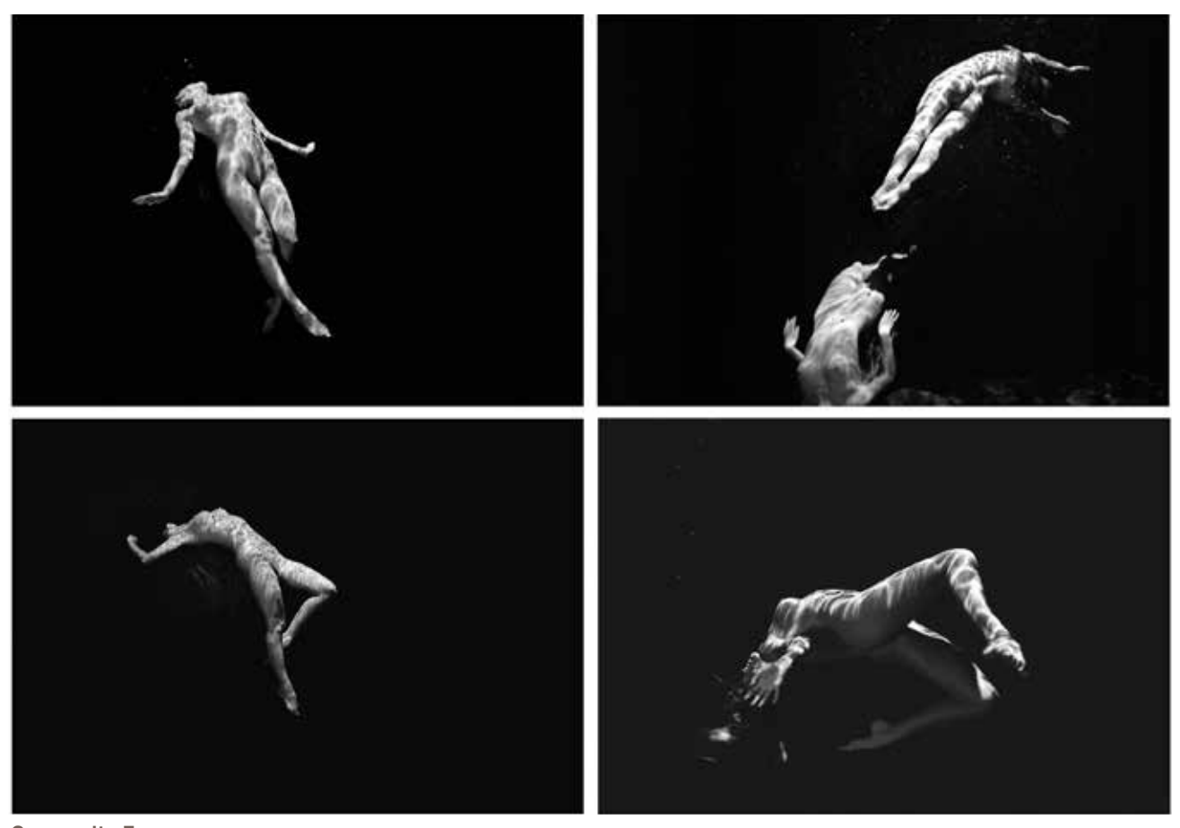
Composite Form Abstract Mermaid 3 19 22b 24, 2015, Archival pigment print, Each individual piece 24 X 16.5 inches (61 X 41.9 cm), Total installed 50 X 35 inches (127 X 116.8 cm) Edition of 3 + 1AP