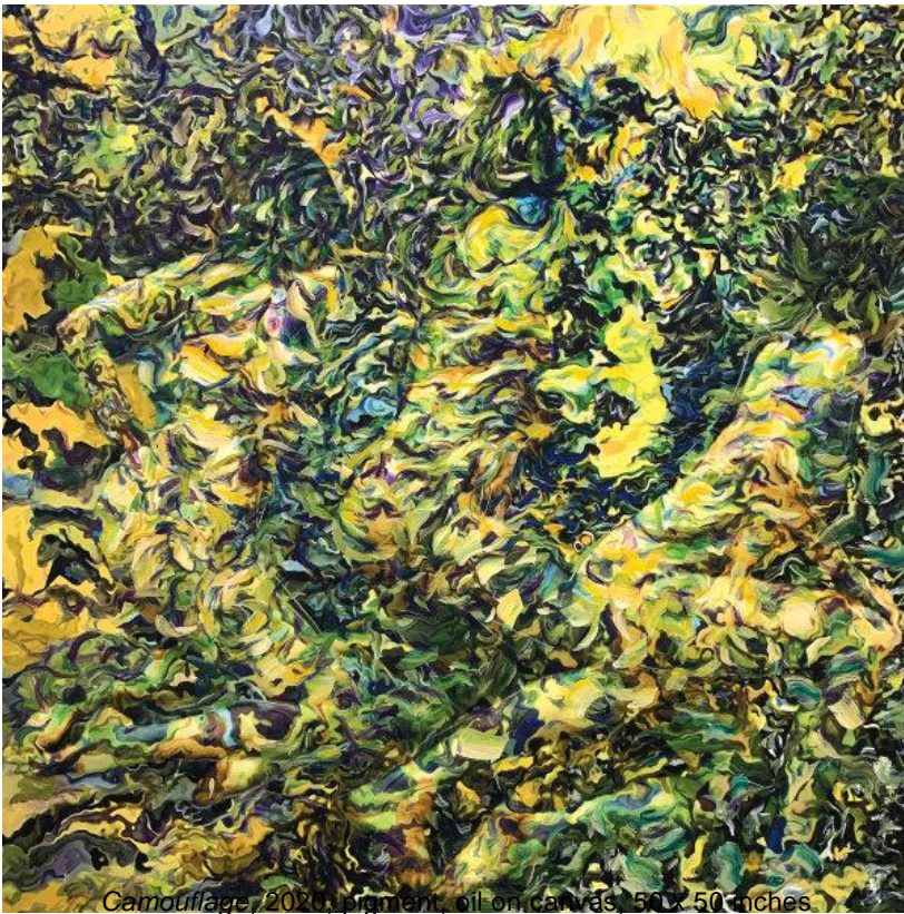
Camouflage, 2012, pigment, oil on canvas, 50 x 50 inches

With its penetrating honesty, Kremer’s art challenges us to undergo a process of self-discovery.