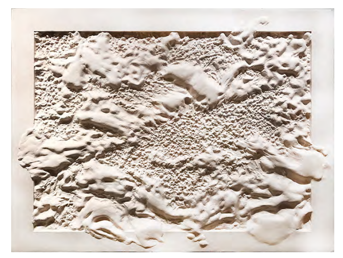
Earthborn, bas-relief without video