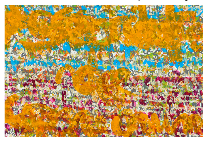
detail of: The art matrix (La matrice d'art), 2017, acrylic on cotton, 59 3/4 x 43 inches

L'Impureté de Dieu: Souillures et Scissions dans la pensée juive, Éditions du Félin, 1991 (rééd. revue et augmentée, 2005); Céline seul, Gallimard, 1993; Le Sexe de Proust, Gallimard, 1994; De l'antisémitisme, Julliard, 1995 (rééd. revue et augmentée, Climats Flammarion, 2006); La Mort dans l'œil: Critique du cinéma comme vision, domination, falsification, éradiction, fascination, manipulation, dévastation, usurpation, Maren Sell Éditeurs, 2004; Debord ou la Diffraction du temps, Gallimard, 2008