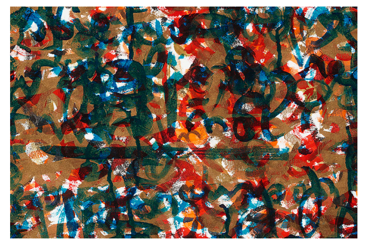
detail of: Detachment (Détachement), 2017, mixed media on paper, 51 1/5 x 79 inches

Jouissance du temps (Enjoyment of Time) is a series of twelve recent paintings and drawings composed by Stéphane Zagdanski in 2016 and