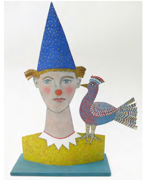
Clown à l'oiseau, 2015, painted zinc & wood 14 1/2 x 11 3/4 x 3 1/8 inches

CV & HI-RES IMAGES AVAILABLE ON REQUEST.