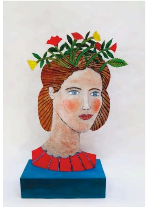
Femme Fleur , 2015, painted zinc & wood 15 x 9.5 x 4 inches

"From a formal point of view, I realized that the painted sculpture simulated volume," he says. "So a little unexpectedly, I developed a personal style."