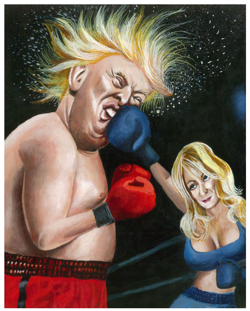
Thump Trump, 2018, acrylic on panel, 10 x 8 inches

FOR FURTHER INFORMATION CALL: 415/541-0461 / FAX: 415/541-0425, OR EMAIL TO:INFO@MODERNISMINC.COM.HI-RES IMAGES AVAILABLE ON REQUEST.