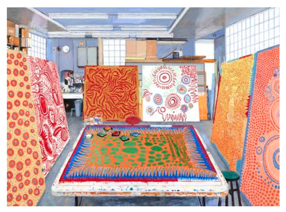
Yayoi Kusama's studio